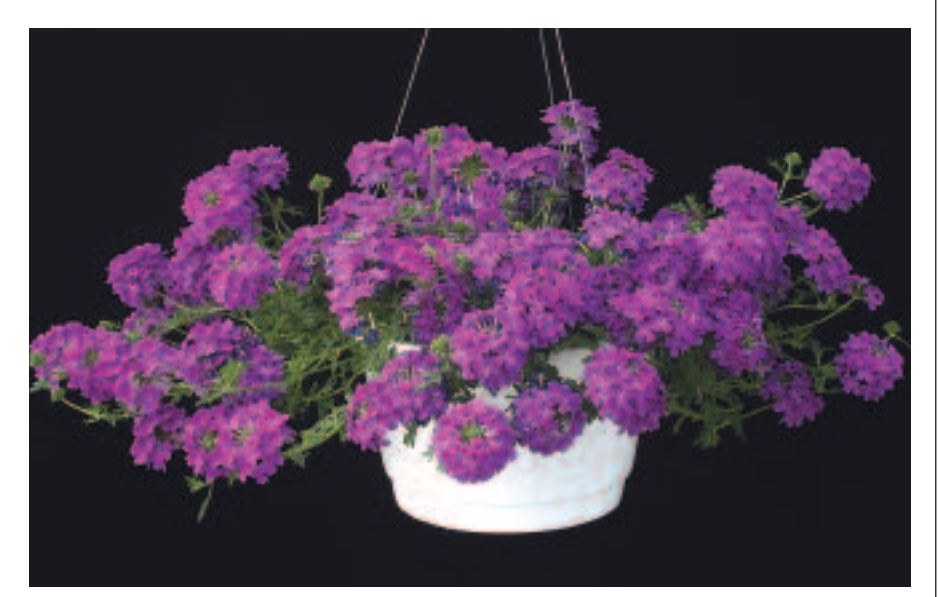
Lascar Blue verbena (Selecta First Class)

Merit Awards. 'Aztec Red Velvet' from Ball FloraPlant has a uniform, medium vigor and spreading growth habit. The large flowers are a bright true red with a light cream center. It makes a very attractive plant and is highly resistant to mildew.