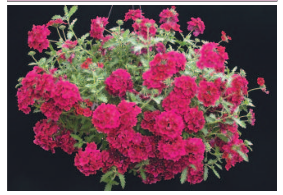
Red Fox Deep Purple verbena (Dummen USA)

habit. The flower size is slightly smaller than average with a below average color display.