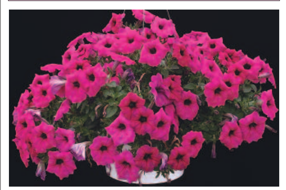
Fame Electric Purple petunia (Selecta First Class)