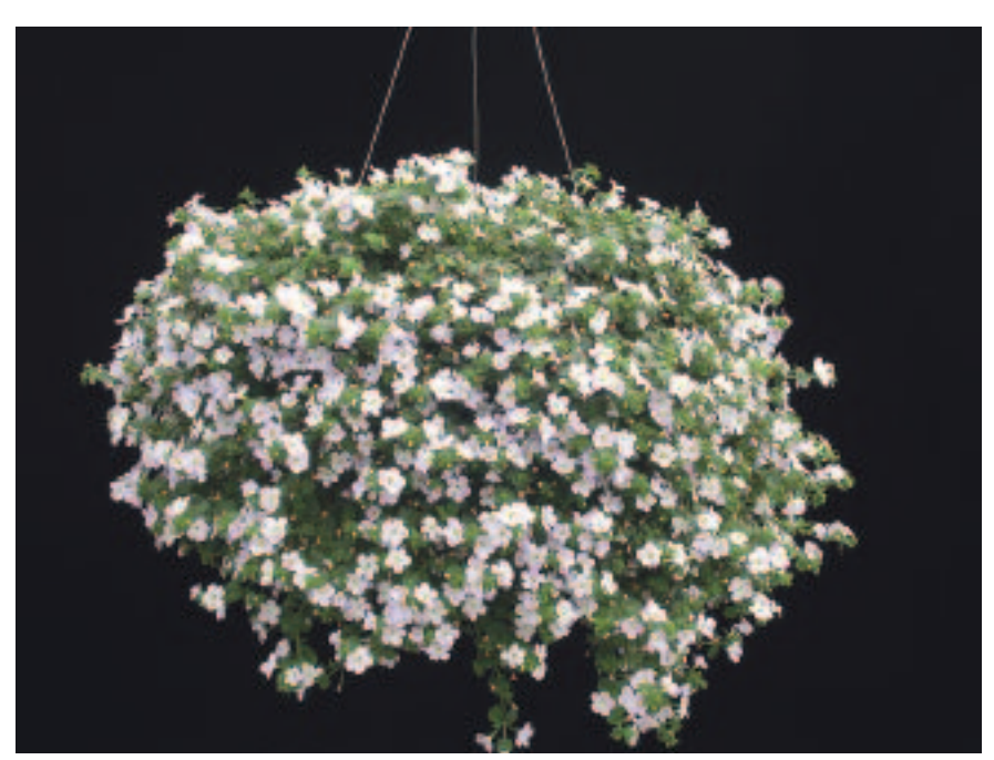
Big Lavender Falls bacopa (Selecta First Class)

he Elite Performer Trial by FloraStar is designed to determine those varieties that are the easiest and best in greenhouse production. The production trials are conducted at the University of Florida, and this is the first independent program to compare and evaluate varieties in a production format instead of landscape. The entries are also included in the landscape trials at North Carolina State University, Pennsylvania State University, Colorado State University and the University of Florida to ensure that each variety does actually perform in the landscape as well as on the bench.